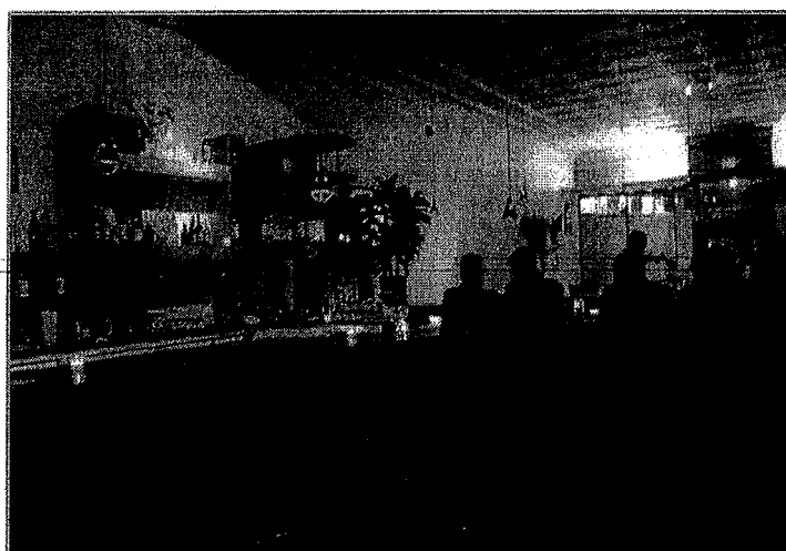
Starline Social Club in Oakland opens this week.

Starline Social Club — an eclectic new restaurant, bar, and performance space on the edge of Uptown Oakland — is set to launch this week.